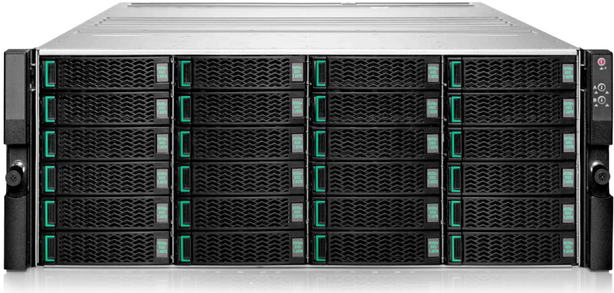
HPE Alletra 6000 array (Base array, 4U; 24 bays with NVMe SSDs)